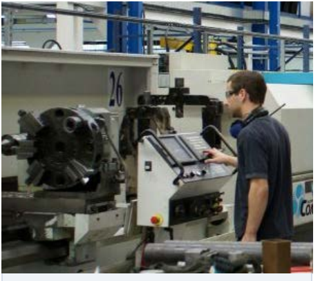
Hone-All Precision Ltd provides a complete 'one stop shop' service for machined components destined for the oil and gas industry.

"Oil and gas components typically involve difficult-tomachine materials such as high specification alloys and exotics that demand special applications knowledge and the right machines and tooling," says Colin Rodney, managing director. "When you are working with expensive materials and have relatively long cycle times, the last thing you need is a problem with a finish machining operation such as honing or any risk of damage or marking of the component. It's not just the cost of the scrapped