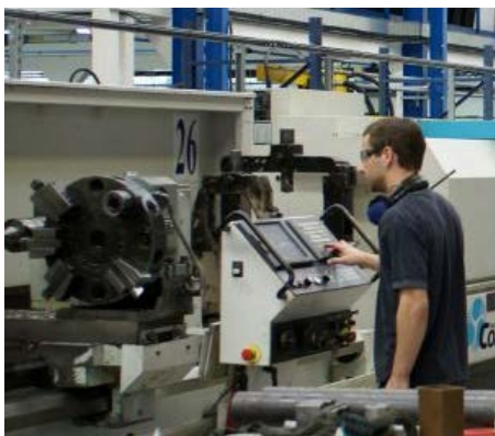
Hone-All Precision Ltd provides a complete 'one stop shop' service for machined components destined for the oil and gas industry.

To see Hone All at Offshore Europe – visit www.offshore-europe.co.uk/HoneAllPrecision